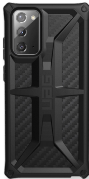
CARBON FIBER SKU // 212191114242 UPC // 812451036411