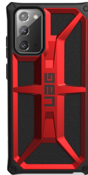
CRIMSON SKU // 212191119494 UPC // 812451035551