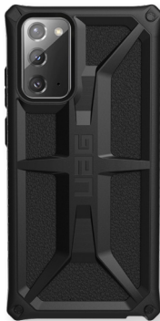
BLACK SKU // 212191114040 UPC // 812451035544