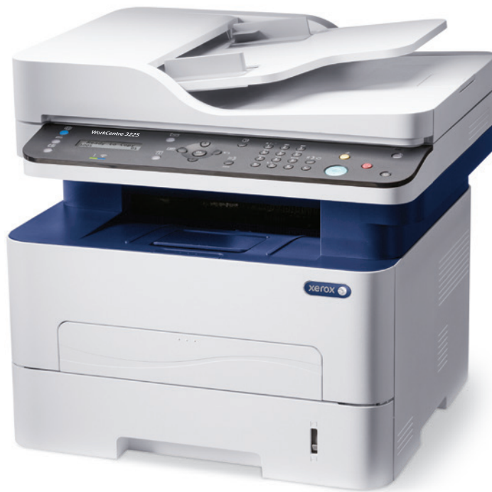
WorkCentre 3215/3225. Copy. Print. Scan. Fax. Email.