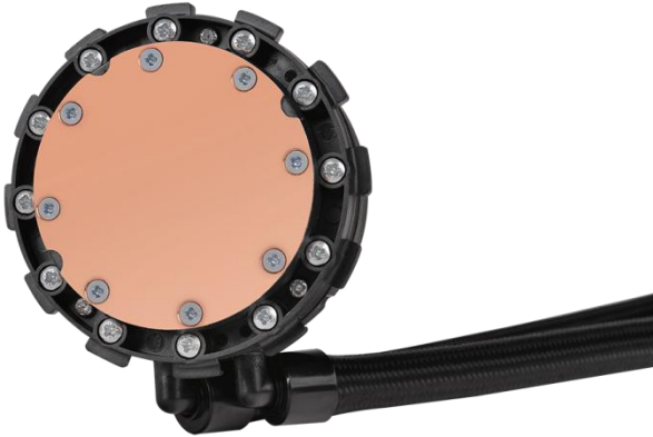
High Performance Water Block