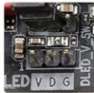
Digital Pin Header