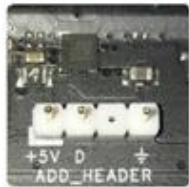
Aura Addressable Header