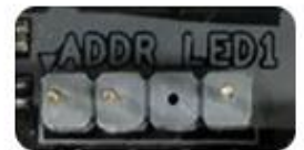
Addressable RGB LED Header