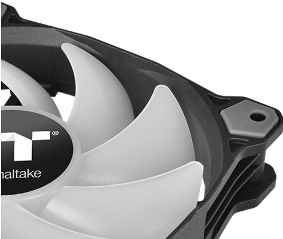
Powerful Cooling Fan