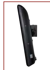
+15/-5° tilt for viewing angle adjustment

(800) 865-2112 (708) 865-8870 Fax: (708) 865-2941 www.peerlessmounts.com