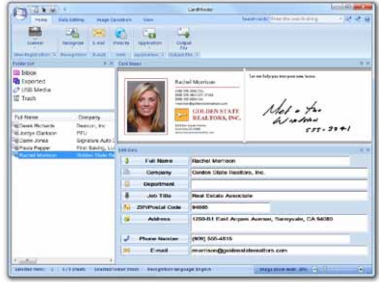
CardMinder for Windows® shown

Scan, store, and edit business card information with the bundled CardMinder software for Mac and PC and even export data into other applications like Address Book, Excel, and Salesforce.