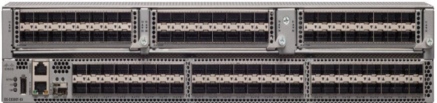
HPE Storage Fibre Channel Switch C-series SN6630C

The HPE Storage Fibre Channel Switch C-series SN6630C can be provisioned, managed, monitored, and troubleshot using Cisco Data Center Network Manager (DCNM), which currently manages the entire suite of Cisco data center products. Powered by C-series MDS 9000 NX-OS Software, it includes storage networking features and functions and is compatible with C-series SN8700C/SN8500C (MDS 9700) Series Multilayer Directors, C-series SN6610C (MDS 9132T) Multilayer Fabric Switches, C-series SN6620C (MDS 9148T) Multilayer Fabric Switches, C-series SN6010C (MDS 9148S) Multilayer Fabric Switches and C-series SN6500C (MDS 9250i) Multi-service Fabric Switches, providing transparent, end-to-end service delivery in core-edge deployments.