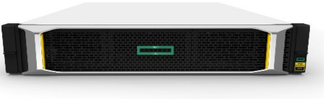
HPE MSA 2052 SAN Storage