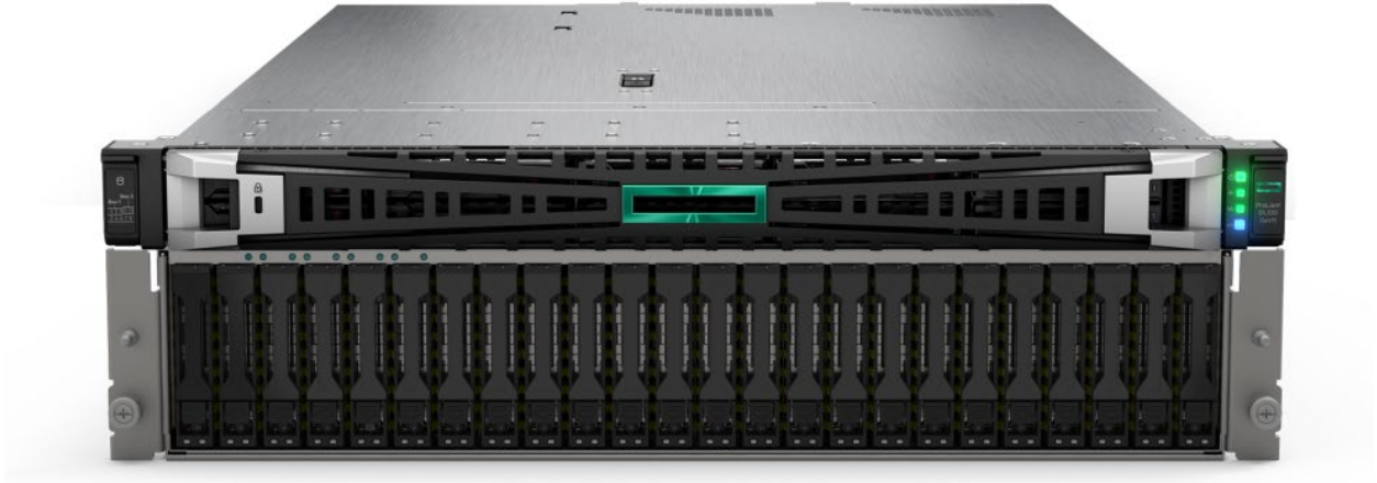
HPE Cray Storage Systems C500