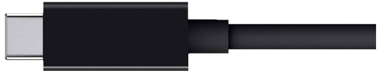
Reversible USB Type C Connectors