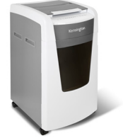
OfficeAssist™ Auto Feed Shredder A6000-HS Anti-Jam Micro Cut K52052AM