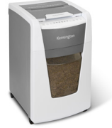
OfficeAssist™ Auto Feed Shredder A3000-HS Anti-Jam Micro Cut K52051AM