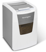
OfficeAssist™ Auto Feed Shredder A1500-HS Anti-Jam Micro Cut K52050AM