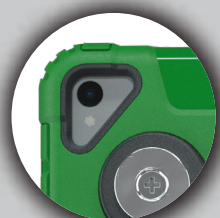
Openings for all Ports and Buttons