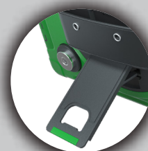
Built in Kickstand