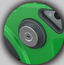
Magnets Embedded for Mounting

Easily adjusts for horizontal or vertical views