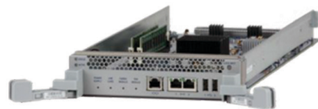
Figure 11: Arista 7500 Series supervisor

The supervisor modules for the 7500E series run Arista Extensible Operating System (EOS) and handle all control plane and management functions of the system. One supervisor module is needed to run the system and a second can be added for stateful 1+1 redundancy. Each supervisor module takes up only a half slot resulting in very efficient use of space and a higher density design. The quad-core x86 CPU with 16 GB of DRAM and an optional SSD provides the control plane performance needed to run an advanced data center switch scaling to over 1000 physical ports and thousands of virtual ports. A pulse per second clock input port enables synchronizing with an external source to improve the accuracy of monitoring tools.