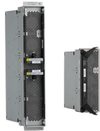
Figure 12: Arista 7500 Series fabric modules

hash-based selection of fabric links, the 7500E architecture provides 100% efficient connectivity from any port to any other port with no drops. The fabric modules are always active-active, provide N+1 redundancy, and can be hot-swapped with zero performance degradation. The fabric modules for the 7508E and the 7504E are different, based on the size of the chassis, and both integrate a fan assembly for flexible and redundant cooling.