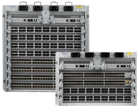
Figure 10: Arista 7500 Series Chassis

The 7500E chassis provides room for two supervisor modules, four or eight line card modules, four power supply modules, and six fabric modules. The 7504 chassis fits into 7-rack units while the 7508 chassis fits into 11U of a standard data center rack. Supervisor and line card modules plug in from the front, while the fabric and power supply modules are inserted from the rear. The midplane is completely passive and provides control plane connectivity to each of the fabric and line card modules. The system design is optimized for data center deployments with front-to-rear airflow.