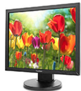
ViewSonic Flicker-Free Technology

For more product information, visit us at www.viewsoniceurope.com