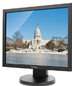
Dynamic Contrast Ratio