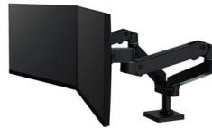
LX Pro Dual Side-By-Side