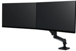
LX Pro Dual Direct