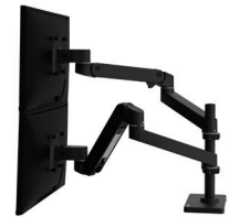
LX Pro Dual Stacking