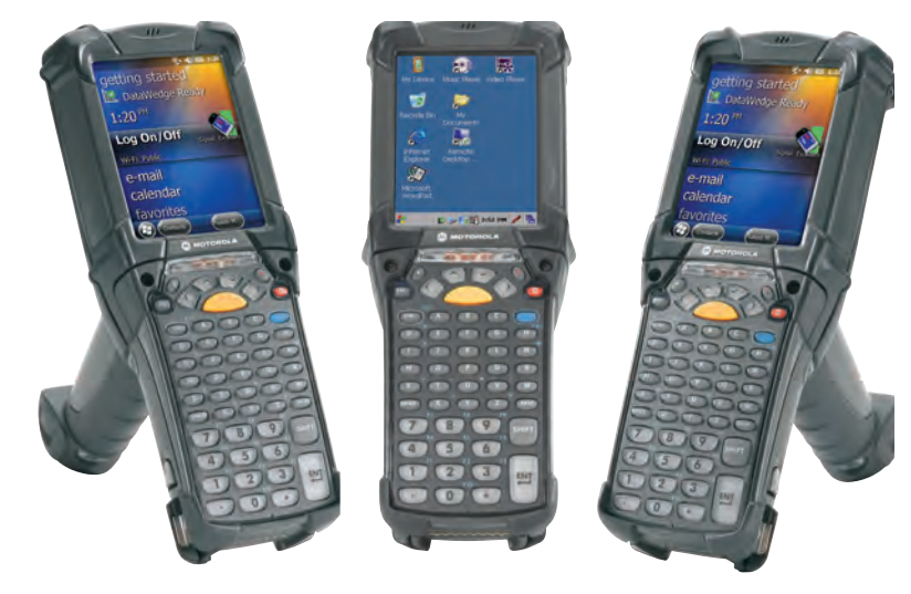
ENABLING THE NEXT GENERATION OF BUSINESS EFFICIENCY.

We took the best and made it better to bring you the next generation in the MC9000 Series, the MC9200. You get the same great form factor and the same great rugged design, with more of what you need most. More processing power. More memory. Faster wireless connections. Everything you need to support next-generation mobile applications with sophisticated and intuitive graphics interfaces that help employees work even faster and smarter.