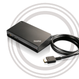
ThinkPad@ OneLink+ Dock