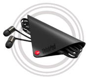
ThinkPad@ X1 In-Ear Headphones