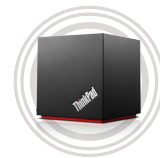
ThinkPad@ WiGig Dock