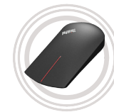
ThinkPad@ X1 Wireless Touch Mouse