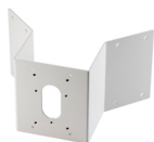
CAS-2402 Corner mount