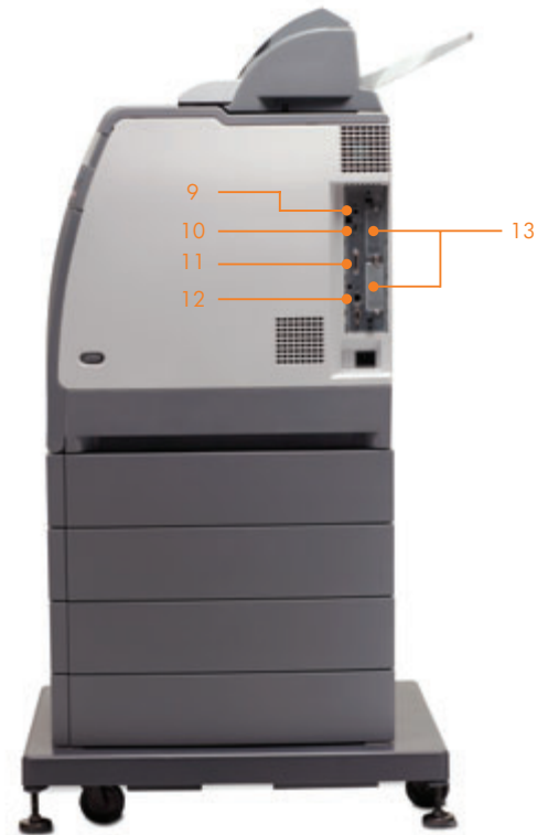
HP Color LaserJet 4700ph+ printer shown