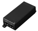
WJ-PU201P PoE Injector