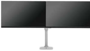
STANDARD CONFIGURATION SUPPORTS TWO DISPLAYS