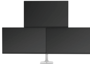
ONE LX ARM, EXTENSION AND COLLAR KIT SUPPORTS THREE DISPLAYS