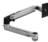
POLISHED ALUMINUM WITH BLACK ACCENTS 97-940-026

LX ARM, EXTENSION AND COLLAR KIT REQUIRED TO ADD A THIRD AND FOURTH ARM TO THE TALL POLE VERSION