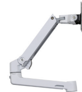
WHITE WITH GREY ACCENTS 98-130-216