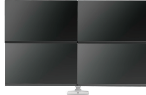
ONE LX ARM, TWO EXTENSION AND COLLAR KITS SUPPORT FOUR DISPLAYS