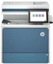
HP Color LaserJet Enterprise MFP 5800f Printer

This printer is intended to work only with cartridges that have a new or reused HP chip, and it uses dynamic security measures to block cartridges using a non-HP chip. Periodic firmware updates will maintain the effectiveness of these measures and block cartridges that previously worked. A reused HP chip enables the use of reused, remanufactured, and refilled cartridges. More at: http://www.hp.com/learn/ds