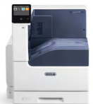
Xerox® VersaLink® C7000 Color Printer