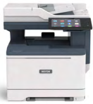
Xerox® VersaLink® C415 Color Multifunction Printer