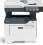
Xerox® VersaLink® B415 Multifunction Printer