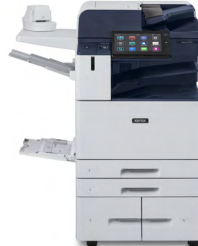
Xerox® AltaLink® C8130/C8135/ C8145/C8155/ C8170 Color Multifunction Printer