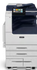
Xerox® VersaLink® C7120/C7125/ C7130 Color Multifunction Printer