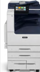
Xerox® VersaLink® B7125/B7130/ B7135 Multifunction Printer