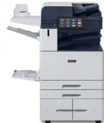
Xerox® AltaLink® B8145/B8155/ B8170 Multifunction Printer

To learn more about Xerox® ConnectKey Technology, go to www.ConnectKey.com .