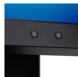
Ambient and human sensors