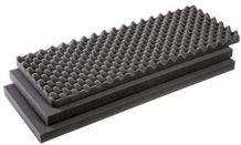
1701FS 3 pc. Replacement Foam Set