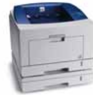
Phaser 3435 shown with optional Tray 2