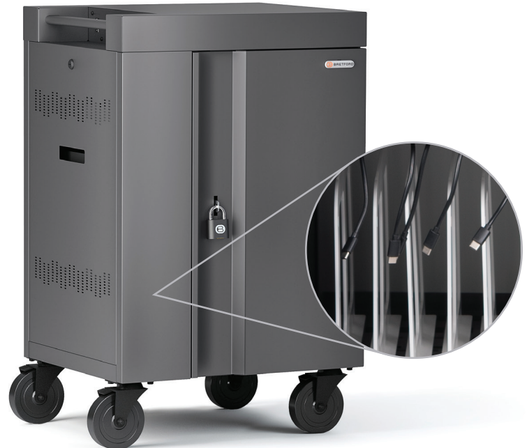
CUBE Cart Mini® Pre-Wired shown in Platinum (PM)