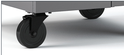
INDUSTRIAL GRADE | 5 in. wheels with locking casters.