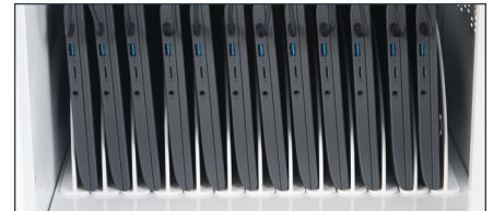
SMART POSITIONS | Durable slot dividers keep devices upright and protected.