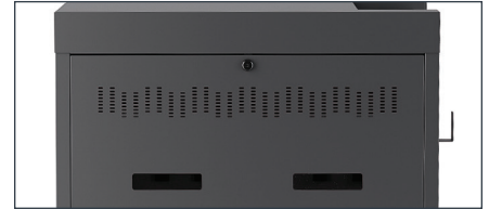
ADAPTER STORAGE | Included adapters stored in removable locked panel in the back of the cart