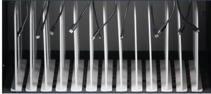
SETUP MADE EASY | Save valuable time by not having to wire each cart.