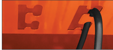
CONVENIENT CABLE MANAGEMENT | The Cable Boss™ cord management system provides notched hooks that make it easy to organize cables.