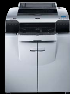
Epson Stylus Pro 4880 (Shown with optional printer stand)