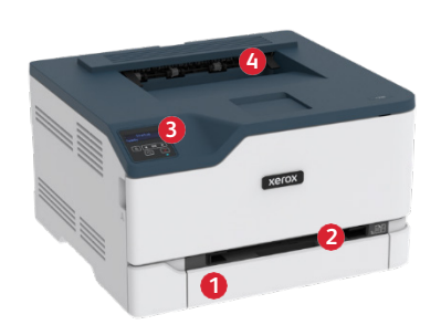
Xerox<sup>®</sup> C230 Colour Printer