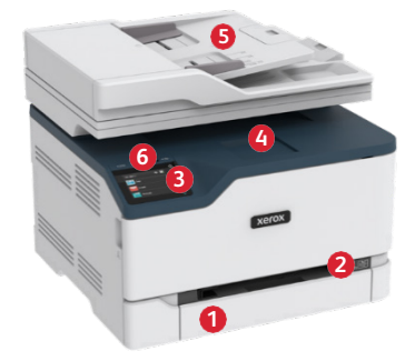
Xerox® C235 Colour Multifunction Printer