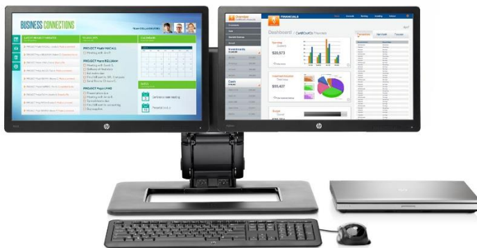
HP ProDisplay P223 and HP Adjustable Dual Display Stand dual monitor configuration shown. (Note: monitors and stands sold separately)

Your ideal office configuration begins with two HP ProDisplay P223 monitors combined with an HP Adjustable Dual Display Stand (AW664AA) for a small footprint, high productivity work solution.*