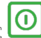
Outlet control LEDs

Remotely manage outlets so users can turn outlets off that are not in use or recycle power to locked-up equipment (minimize costly downtime and avoid travel time to equipment).