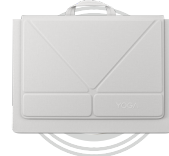
Lenovo Yoga Tote Sleeve