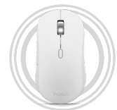
Lenovo Yoga Bluetooth Silent Mouse