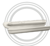
Lenovo Yoga Pen Gen 2 with Case