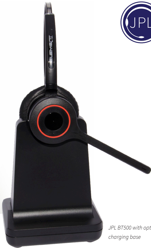
JPL BT500 with optional charging base