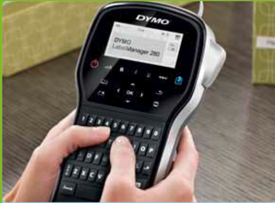
On the go