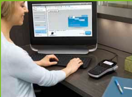
At your desk