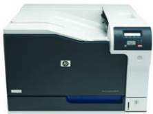
HP Color LaserJet Professional CP5225dn Printer