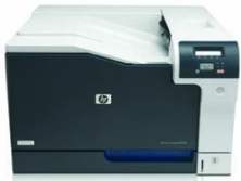
HP Color LaserJet Professional CP5225n Printer

Cover all your colour business printing needs from postcards to oversize documents, with this versatile and affordable A3 desktop printer. Get superior print quality with HP ColorSphere toner, fast speeds and ease of use, with unrivalled reliability.