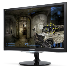
Game Mode ON