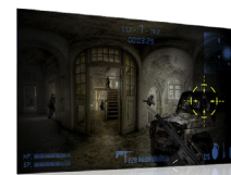
Game Mode OFF

ViewSonic's Game Mode provides heightened visibility and detail by brightening dark scenes. Dominate the competition and see your opponents' every move, even in the darkest scenes of a video game. With just the press of a button, ViewSonic's Game Mode delivers superior color performance for the ultimate gaming experience.