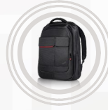
ThinkPad Professional Backpack