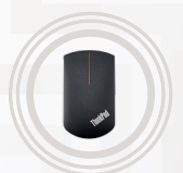
ThinkPad Precision Wireless Mouse