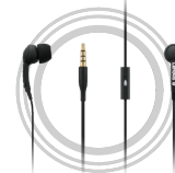
Lenovo 100 In-Ear Headphone