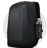
Lenovo 15.6" Laptop Casual Backpack B210