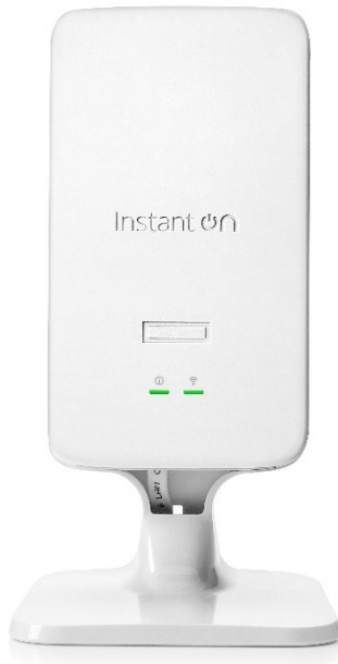
HPE Networking Instant On Access Points AP22D

The HPE Networking Instant On Access Points AP22D is the more versatile version of the AP22. It has the same antenna array and spatial streams (2x2:2) but has a 2.5GbE uplink port and four 1GbE downlink ports for hardwired devices. The AP22D can also supply Power over Ethernet (PoE) to two of the downlink ports at 15W (PoE 802.3af) when powered with Class 6 PoE 802.3bt or the optional DC power supply. When powered by Class 4 PoE 802.3at, the AP22D will supply power to one port at 15W (PoE 802.3af). This makes the AP22D great for IP phones or receipt printers in areas that need more Ethernet ports and only one in-room Ethernet port is available. Great for boutique hotel rooms, home offices, or reception areas.