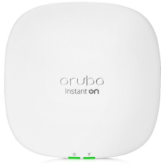
HPE Networking Instant On Access Points AP25

The HPE Networking Instant On Access Points AP25 is our top performer, with a 4x4 antenna array that supports 4 spatial streams to provide coverage and speed in device-dense networks, and is best if used in common areas where 100 or more of your customers can gather. The AP25 2.5GbE uplink port enables more network bandwidth to support the wireless maximum 5.3Gbps throughput for connected clients compared to traditional 1GbE uplink in other Wi-Fi 6 access points.