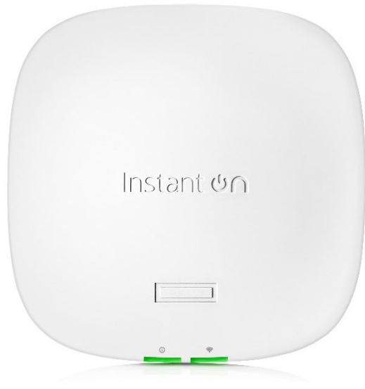
HPE Networking Instant On Access Points AP21

The HPE Networking Instant On Wi-Fi 6 family has the right access point to fit your business needs. From cost-effective single room streaming to conference room collaboration to exhibition hall environments, our wireless solutions make your network accessible and efficient.