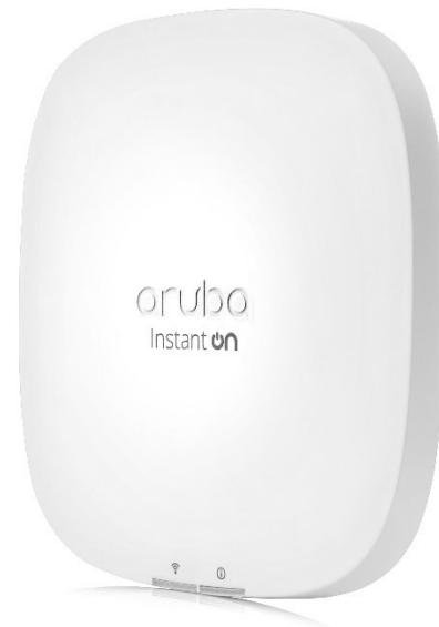
HPE Networking Instant On Access Points AP22

The HPE Networking Instant On Access Points AP22 is our core Wi-Fi 6 access point that gives you the bang for your buck. It hosts a 2x2 antenna array supporting 2 spatial streams with a max aggregate data rate of 1.7 Gbps. The AP22 is ideal for corporate offices, healthcare facilities and hybrid classrooms that require EN certification, or hybrid classrooms. This access point has the same security and reliability as the AP25 at a more attractive price.