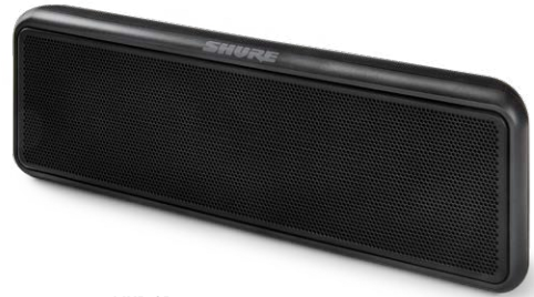
MXP-3B Wall Mount Conferencing Loudspeaker BLACK